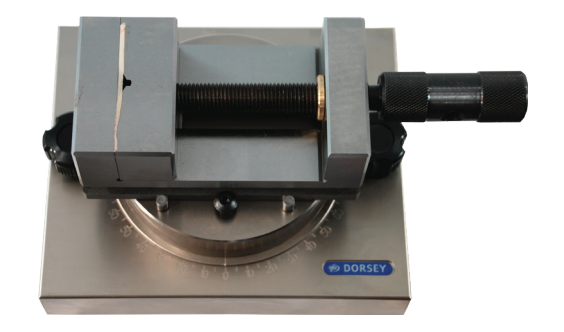
Part # ACC-RV2