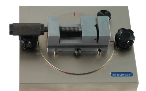
Part # ACC-RV1