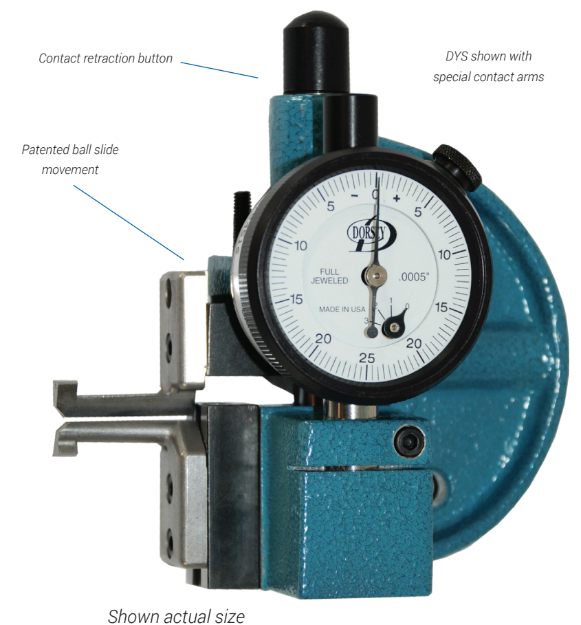
PART # DESCRIPTION DYS-FRAME DYS Groove Gage body only, less gaging arms and indicator 18967 For the Bench Stand used with the DYS gages 2335 Clamp nut used with part # 2305 & #2306 contact arms