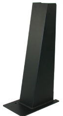
Part# 4394 (used on SMA) Part# 4395 (used on SSM) Up to 36"