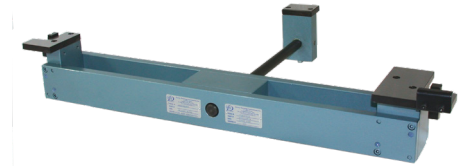
Outrigger assembly for SMF or SSM series masters